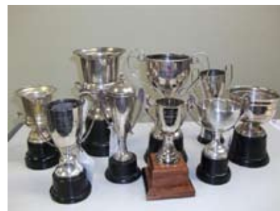
A selection of the trophies won by the Kayaking team