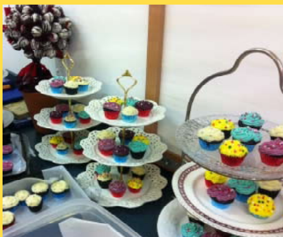
A sample of the Formal supper

A very special thank you also, to the very willing team of cooks, who worked so efficiently to produce a wonderful supper for the students to enjoy. As many capable hands make light work, this is a fun and rather painless PTA fundraiser.