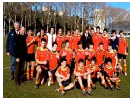
Dunstan U16 Rugby Team

being the very first competition game. In winning the competition, the team has scored 451 points while conceding 157. The players have stepped up after three members from last year moved up to the 1st XV. Their willingness to play for each other and as a team has netted a great result.